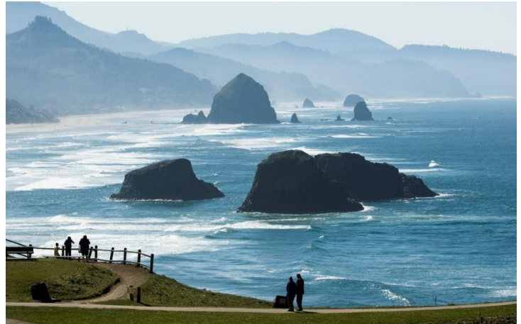
Photo: Looking south from Ecola State Park, Tillamook Head (Ben Nieves).

Thanks to its spectacular natural landscape and biodiversity, this area draws tourists from all over the world, lures retirees from across the state and attracts a variety of recreational and commercial fishermen. The people of Manzanita, Seaside, Cannon Beach and Nehalem are proud of this area's natural resources and understand that a sustainable plan for preserving them is essential for the future of their communities. Notably, the communities of Cannon Beach, Lincoln City, Yachats and Port Orford passed resolutions supporting this common-sense approach.